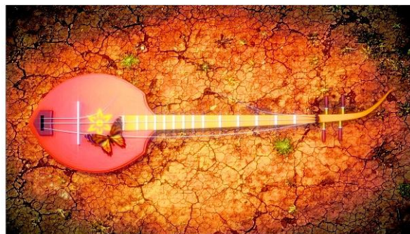
Still images from Buddhist Elation .