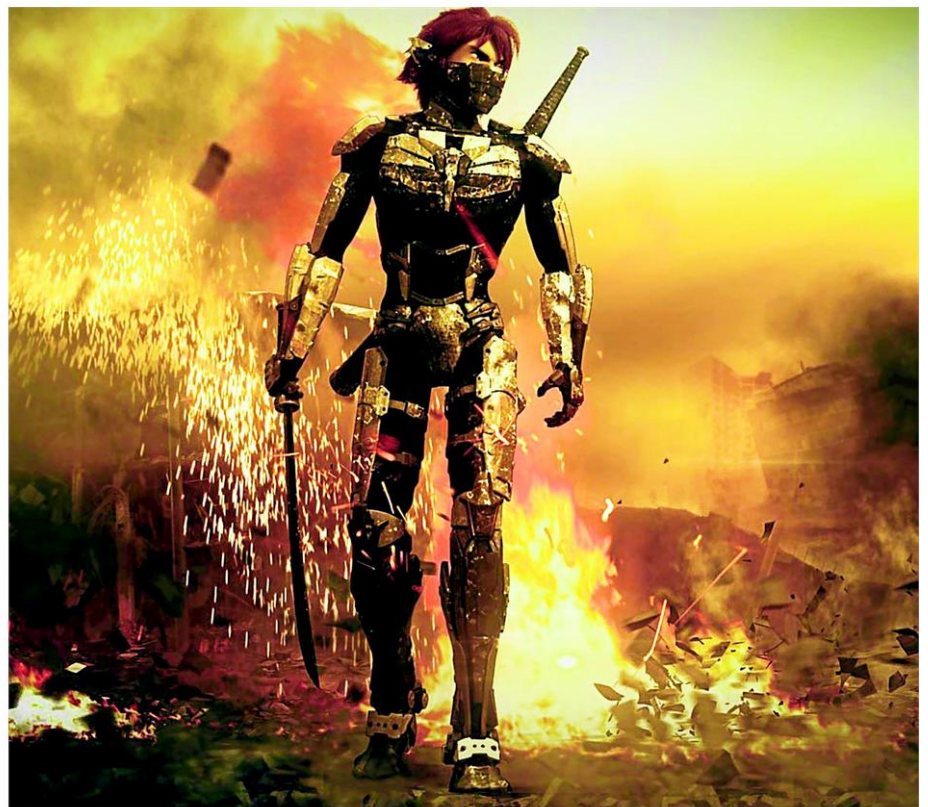
A scene from Rising of the Bangkok Hero .